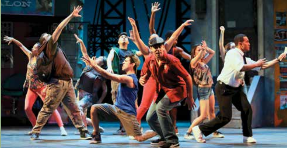
In the Heights , 2018. Elliot Norton Award for Outstanding Ensemble.

Tickets can be purchased individually, for groups, or by subscription and are available at our website or by phone.