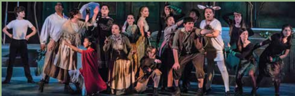
Teen Performance Ensemble of Into The Woods, May 2018.

Box office hours: Tuesday through Friday, 10 a.m. to 6 p.m.