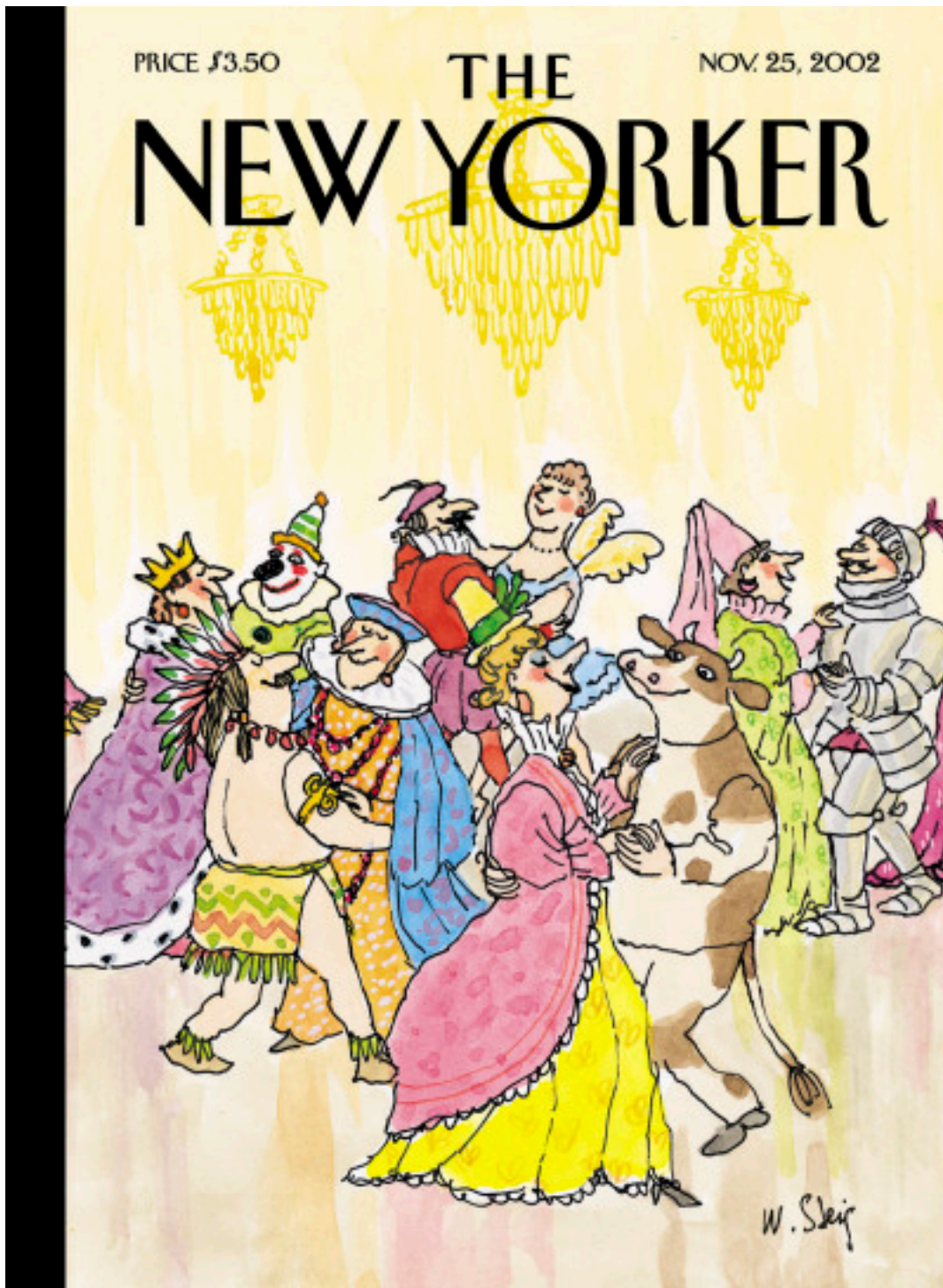
Steig's November 2002 Cover of The New Yorker

What do you notice in this busy cartoon? Does anything remind you of Shrek ? What might this cartoon be trying to say about the world?