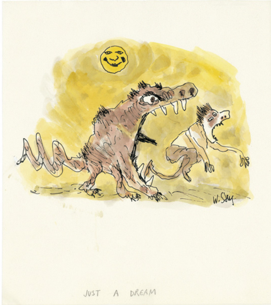
an unpublished Steig: "Just A Dream"

What strikes you about this cartoon? Does it remind you of the creatures in Shrek at all? Does it remind you of any other cartoons you've seen?