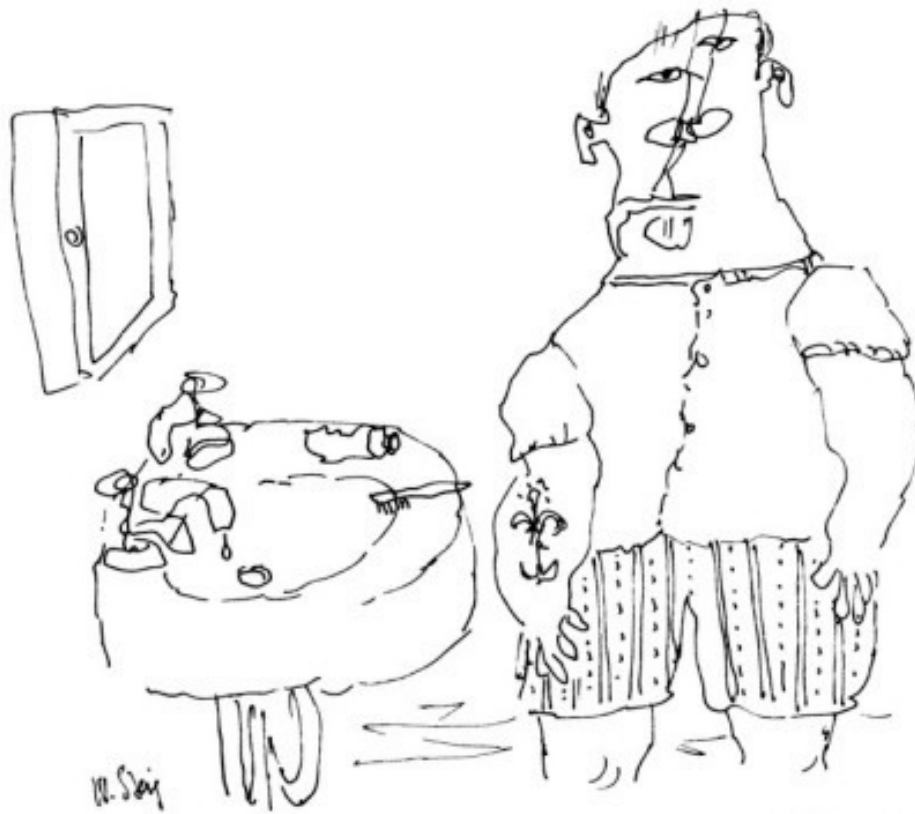
He was once young and foolish.

a symbolist drawing, published in The New Yorker