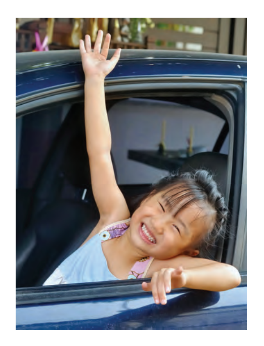
Then we will leave Wheelock Family Theatre.

When the play is over, we will go back to the lobby.