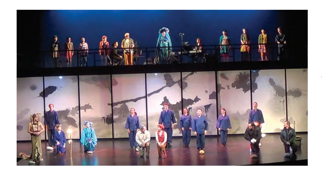
This is called a curtain call .

At the end of the play, all of the actors will come out on stage and bow.