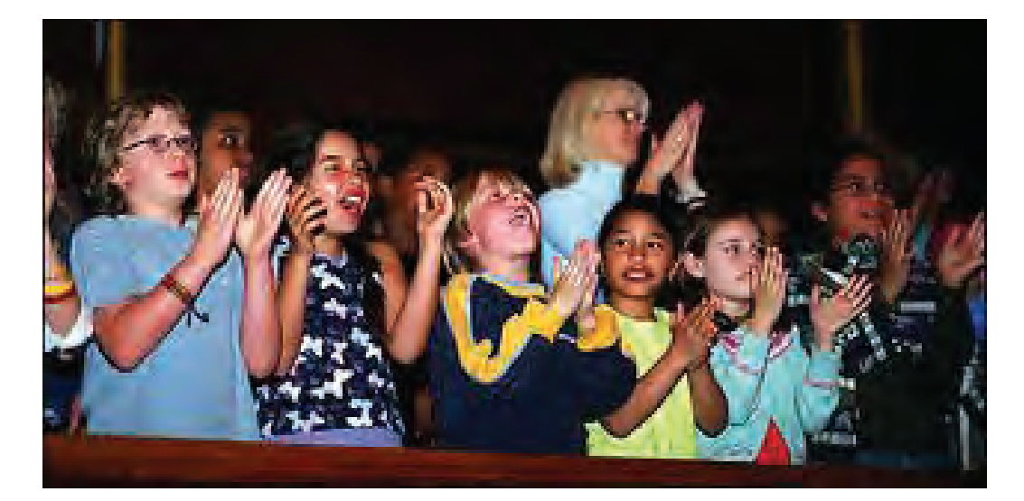
If I want to clap, I can. I don't have to clap if I don't want to.

Many people will clap a lot, so the actors will know how much they liked the play. Sometimes people will stand up and clap.